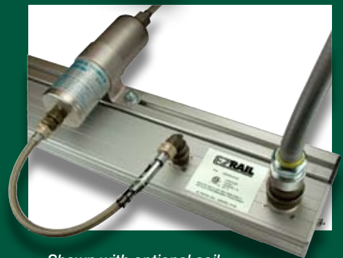
Shown with optional coil rail mounted to EZRail